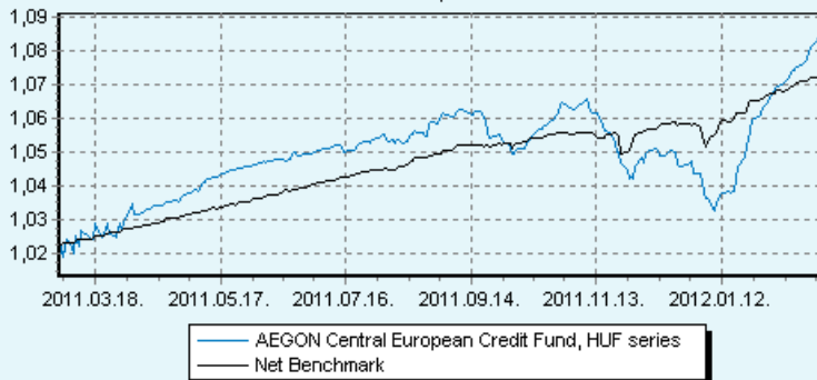
NET ASSET VALUE PER SHARE, 2011.03.01 - 2012.02.29

Past performance is no guarantee of future results. This report should not be considered as an offer or investment advisory. The Fund Prospectus contains the detailed conditions of the investment. The distribution costs of the fund purchase can be found at the distributors.