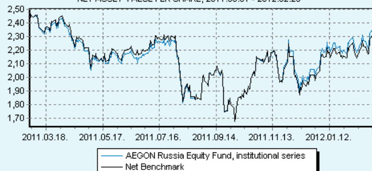
NET ASSET VALUE PER SHARE, 2011.03.01 - 2012.02.29

Past performance is no guarantee of future results. This report should not be considered as an offer or investment advisory. The Fund Prospectus contains the detailed conditions of the investment. The distribution costs of the fund purchase can be found at the distributors.