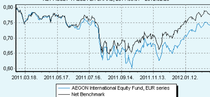
NET ASSET VALUE PER SHARE, 2011.03.01 - 2012.02.29

Past performance is no guarantee of future results. This report should not be considered as an offer or investment advisory. The Fund Prospectus contains the detailed conditions of the investment. The distribution costs of the fund purchase can be found at the distributors.