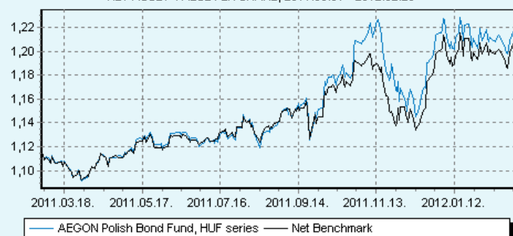
NET ASSET VALUE PER SHARE, 2011.03.01 - 2012.02.29

Past performance is no guarantee of future results. This report should not be considered as an offer or investment advisory. The Fund Prospectus contains the detailed conditions of the investment. The distribution costs of the fund purchase can be found at the distributors.