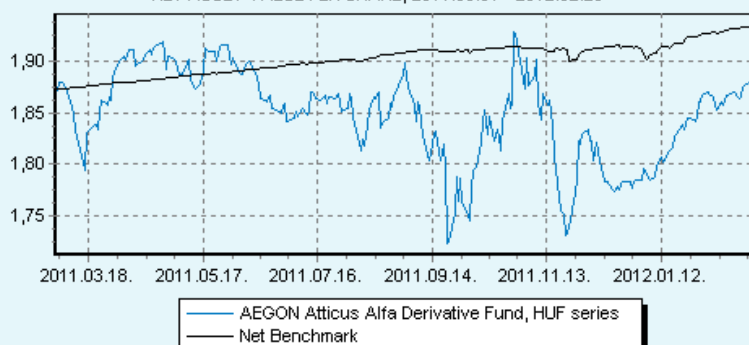
NET ASSET VALUE PER SHARE, 2011.03.01 - 2012.02.29

Past performance is no guarantee of future results. This report should not be considered as an offer or investment advisory. The Fund Prospectus contains the detailed conditions of the investment. The distribution costs of the fund purchase can be found at the distributors.