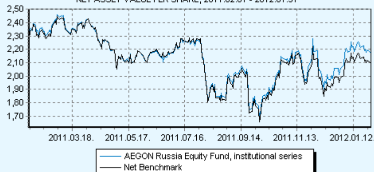
NET ASSET VALUE PER SHARE, 2011.02.01 - 2012.01.31

Past performance is no guarantee of future results. This report should not be considered as an offer or investment advisory. The Fund Prospectus contains the detailed conditions of the investment. The distribution costs of the fund purchase can be found at the distributors.