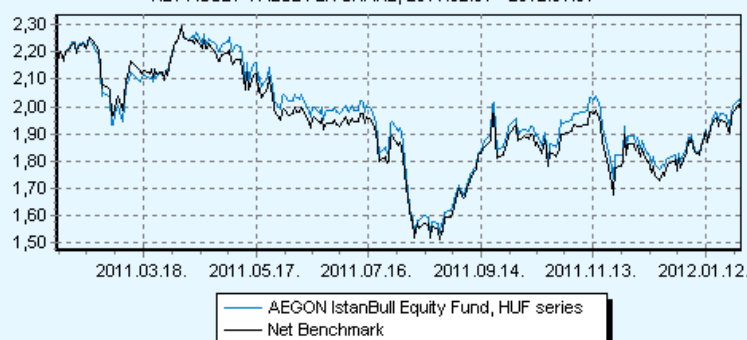
NET ASSET VALUE PER SHARE, 2011.02.01 - 2012.01.31

Past performance is no guarantee of future results. This report should not be considered as an offer or investment advisory. The Fund Prospectus contains the detailed conditions of the investment. The distribution costs of the fund purchase can be found at the distributors.