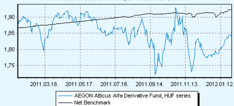
NET ASSET VALUE PER SHARE, 2011.02.01 - 2012.01.31

Past performance is no guarantee of future results. This report should not be considered as an offer or investment advisory. The Fund Prospectus contains the detailed conditions of the investment. The distribution costs of the fund purchase can be found at the distributors.