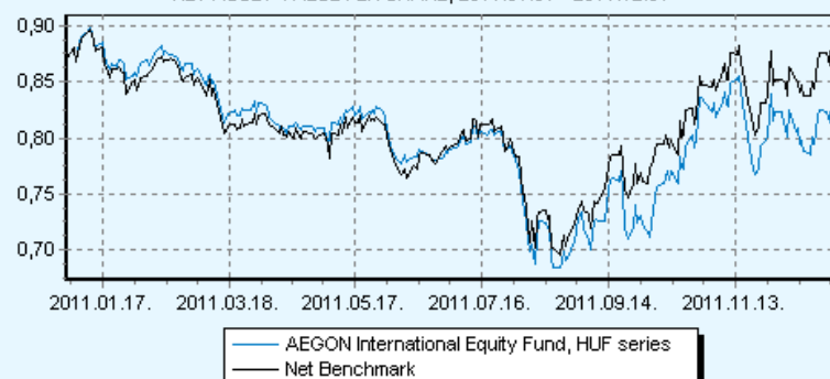
NET ASSET VALUE PER SHARE, 2011.01.01 - 2011.12.31

Past performance is no guarantee of future results. This report should not be considered as an offer or investment advisory. The Fund Prospectus contains the detailed conditions of the investment. The distribution costs of the fund purchase can be found at the distributors.