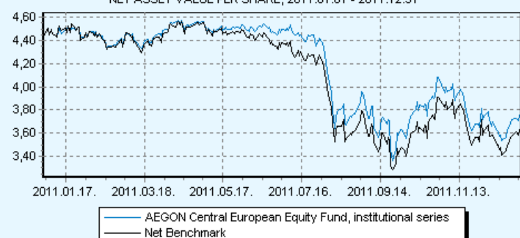
NET ASSET VALUE PER SHARE, 2011.01.01 - 2011.12.31