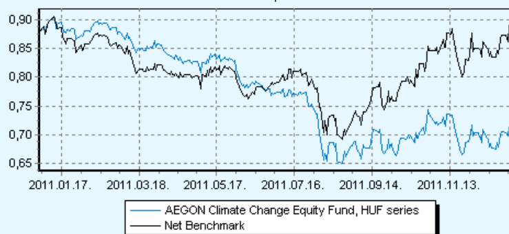
NET ASSET VALUE PER SHARE, 2011.01.01 - 2011.12.31

Past performance is no guarantee of future results. This report should not be considered as an offer or investment advisory. The Fund Prospectus contains the detailed conditions of the investment. The distribution costs of the fund purchase can be found at the distributors.