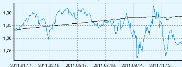
NET ASSET VALUE PER SHARE, 2011.01.01 - 2011.12.31

— AEGON Atticus Alfa Derivative Fund, HUF series — Net Benchmark