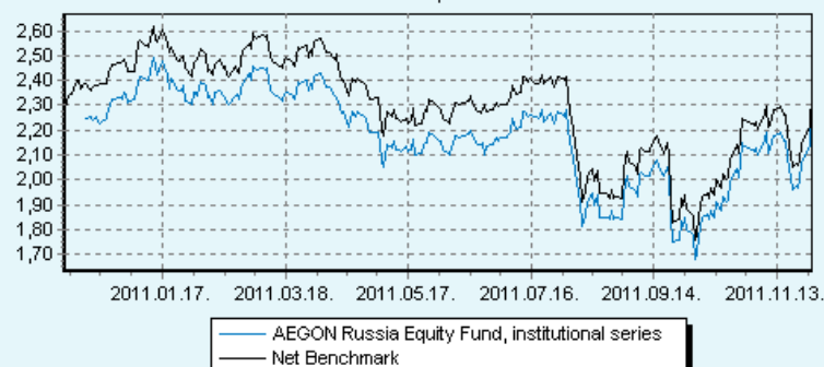
NET ASSET VALUE PER SHARE, 2010.12.01 - 2011.11.30

Past performance is no guarantee of future results. This report should not be considered as an offer or investment advisory. The Fund Prospectus contains the detailed conditions of the investment. The distribution costs of the fund purchase can be found at the distributors.