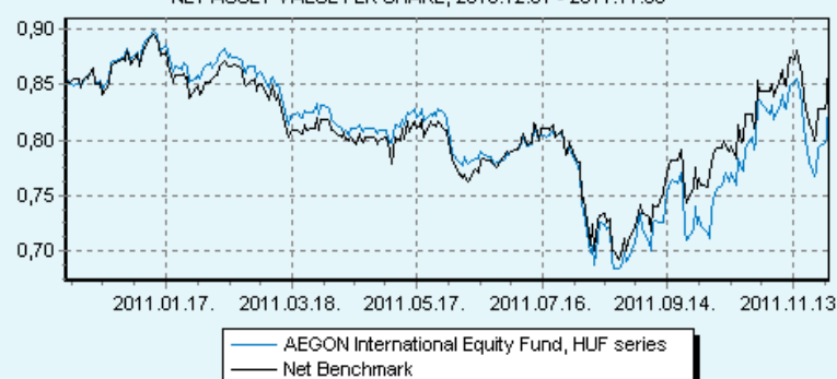
NET ASSET VALUE PER SHARE, 2010.12.01 - 2011.11.30

Past performance is no guarantee of future results. This report should not be considered as an offer or investment advisory. The Fund Prospectus contains the detailed conditions of the investment. The distribution costs of the fund purchase can be found at the distributors.