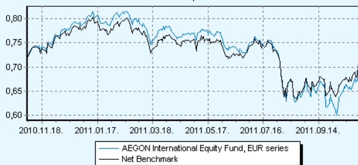
NET ASSET VALUE PER SHARE, 2010.11.01 - 2011.10.31

Past performance is no guarantee of future results. This report should not be considered as an offer or investment advisory. The Fund Prospectus contains the detailed conditions of the investment. The distribution costs of the fund purchase can be found at the distributors.