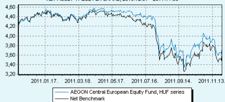
NET ASSET VALUE PER SHARE, 2010.12.01 - 2011.11.30

Past performance is no guarantee of future results. This report should not be considered as an offer or investment advisory. The Fund Prospectus contains the detailed conditions of the investment. The distribution costs of the fund purchase can be found at the distributors.