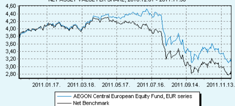
NET ASSET VALUE PER SHARE, 2010.12.01 - 2011.11.30

Past performance is no guarantee of future results. This report should not be considered as an offer or investment advisory. The Fund Prospectus contains the detailed conditions of the investment. The distribution costs of the fund purchase can be found at the distributors.