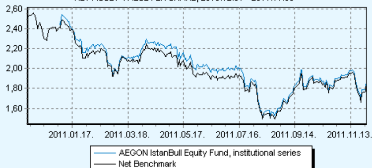
NET ASSET VALUE PER SHARE, 2010.12.01 - 2011.11.30

Past performance is no guarantee of future results. This report should not be considered as an offer or investment advisory. The Fund Prospectus contains the detailed conditions of the investment. The distribution costs of the fund purchase can be found at the distributors.