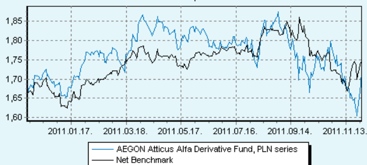
NET ASSET VALUE PER SHARE, 2010.12.01 - 2011.11.30

Past performance is no guarantee of future results. This report should not be considered as an offer or investment advisory. The Fund Prospectus contains the detailed conditions of the investment. The distribution costs of the fund purchase can be found at the distributors.