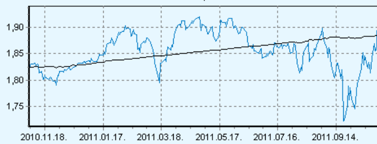
NET ASSET VALUE PER SHARE, 2010.11.01 - 2011.10.31

Past performance is no guarantee of future results. This report should not be considered as an offer or investment advisory. The Fund Prospectus contains the detailed conditions of the investment. The distribution costs of the fund purchase can be found at the distributors.