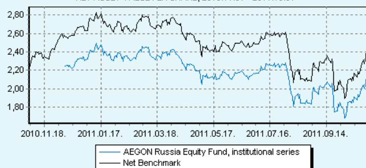
NET ASSET VALUE PER SHARE, 2010.11.01 - 2011.10.31

Past performance is no guarantee of future results. This report should not be considered as an offer or investment advisory. The Fund Prospectus contains the detailed conditions of the investment. The distribution costs of the fund purchase can be found at the distributors.