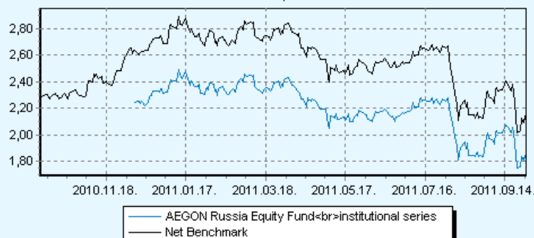
NET ASSET VALUE PER SHARE, 2010.10.01 - 2011.09.30

Past performance is no guarantee of future results. This report should not be considered as an offer or investment advisory. The Fund Prospectus contains the detailed conditions of the investment. The distribution costs of the fund purchase can be found at the distributors.