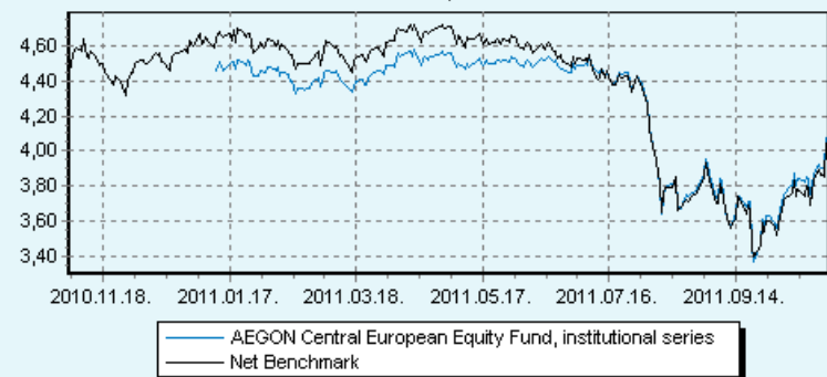
NET ASSET VALUE PER SHARE, 2010.11.01 - 2011.10.31

Past performance is no guarantee of future results. This report should not be considered as an offer or investment advisory. The Fund Prospectus contains the detailed conditions of the investment. The distribution costs of the fund purchase can be found at the distributors.