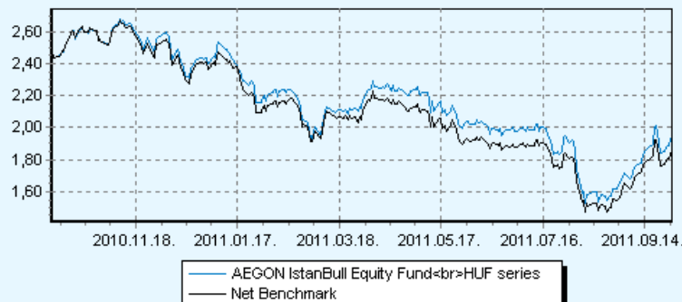
NET ASSET VALUE PER SHARE, 2010.10.01 - 2011.09.30

Past performance is no guarantee of future results. This report should not be considered as an offer or investment advisory. The Fund Prospectus contains the detailed conditions of the investment. The distribution costs of the fund purchase can be found at the distributors.