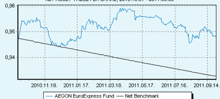
NET ASSET VALUE PER SHARE, 2010.10.01 - 2011.09.30

Past performance is no guarantee of future results. This report should not be considered as an offer or investment advisory. The Fund Prospectus contains the detailed conditions of the investment. The distribution costs of the fund purchase can be found at the distributors.