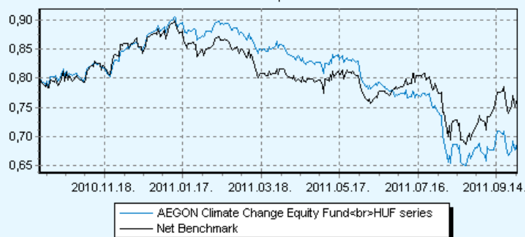
NET ASSET VALUE PER SHARE, 2010.10.01 - 2011.09.30

Past performance is no guarantee of future results. This report should not be considered as an offer or investment advisory. The Fund Prospectus contains the detailed conditions of the investment. The distribution costs of the fund purchase can be found at the distributors.