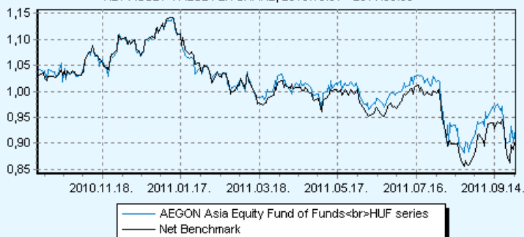
NET ASSET VALUE PER SHARE, 2010.10.01 - 2011.09.30

Past performance is no guarantee of future results. This report should not be considered as an offer or investment advisory. The Fund Prospectus contains the detailed conditions of the investment. The distribution costs of the fund purchase can be found at the distributors.