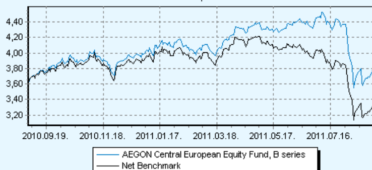
NET ASSET VALUE PER SHARE, 2010.09.01 - 2011.08.31

Past performance is no guarantee of future results. This report should not be considered as an offer or investment advisory. The Fund Prospectus contains the detailed conditions of the investment. The distribution costs of the fund purchase can be found at the distributors.